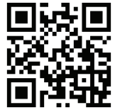
Scan to watch video