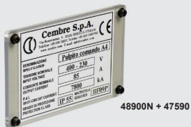
48900N + 47590