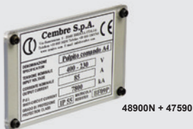
48900N + 47590