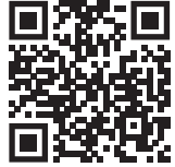
Scan to watch video