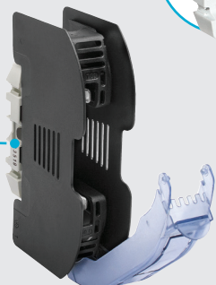
325030 + 354115