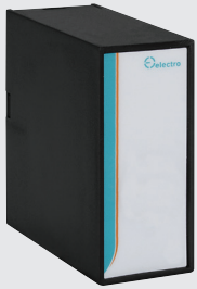
EX11 + EX08